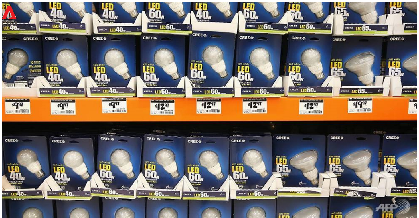
LED light bulbs are offered for sale at a Home Depot store on Dec 27, 2013 in Chicago, Illinois.